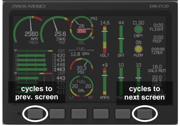
Buttons one and six cycle to the previous and next screens, respectively.

Press the BOOT* button on any selected screen configuration to make it the screen that is shown immediately after the instrument is turned on. Only one screen may be designated as the boot screen. Next, press the TOGGL<sup>1</sup> button on any selected screen to toggle the "<sup>1</sup><sup>m</sup> icon. All screens that show the "<sup>1</sup><sup>m</sup> icon are included in the rotation. Any screen in the rotation may be accessed via the button one and six hotkeys. Press BACK to save any settings.