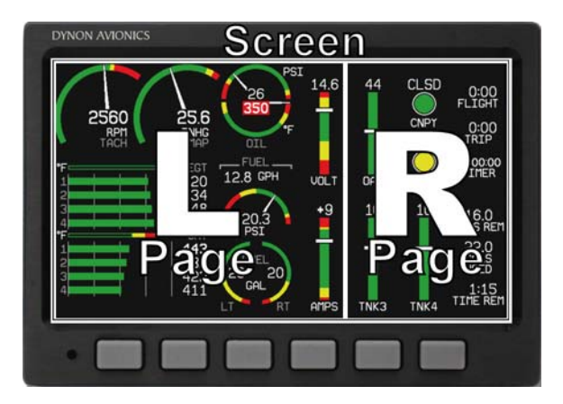
Screens contain one or two pages and pages contain groups of similar information.